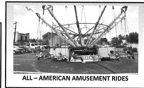
ALL - AMERICAN AMUSEMENT RIDES