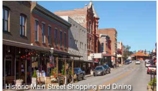
Historic Main Street Shopping and Dining

Our six-block Main Street is an award-winning National Historic District. Located on Arkansas' Antique Trail, Main Street is home to dozens of shops, restaurants and live music - appealing to all tastes.