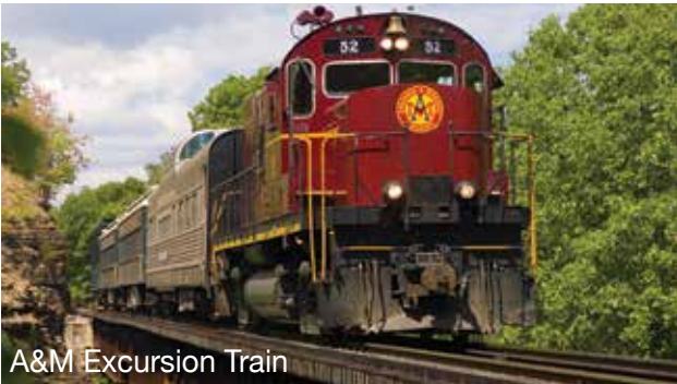
A&M Excursion Train

Scenic adventure awaits every visitor to the Gem of the Arkansas River Valley. Van Buren is the ultimate base camp for outdoor adventure offering comfortable and convenient lodging and great dining experiences for travelers at the end of an exciting day trip.