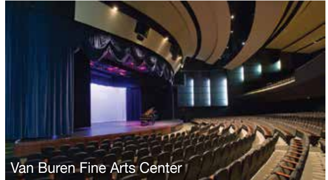
Van Buren Fine Arts Center

The Van Buren Fine Arts Center is a 1,500 seat concert hall that features state-of-the-art performing arts technology, and is uniquely designed to provide the best environment for all genres of music enjoyment. The center also features two art galleries, which display both student and professional exhibits.