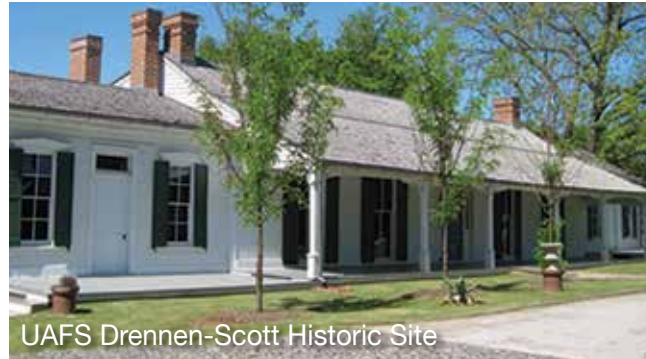
UAFS Drennen-Scott Historic Site