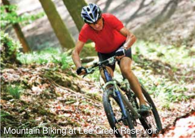
Mountain Biking at Lee Creek Reservoir

Explore the scenic beauty of Crawford County and the Ozark National Forest and discover your own adventure. Fish the Arkansas River, canoe the Mulberry, hike, bike, or take a boat ride at Lake Fort Smith State Park.