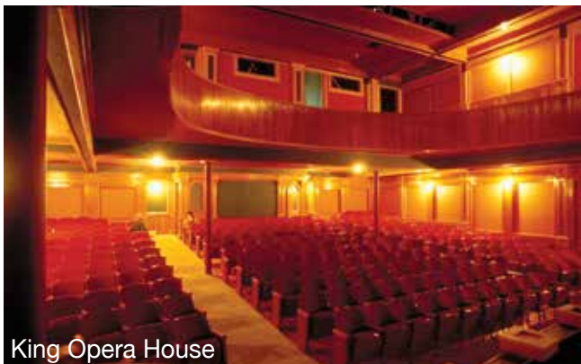
King Opera House

The King Opera House, built in 1891, drew a crowd for famous performers including 1940's musician and entertainer Bob Burns and continues to hold events throughout the year. For a complete list of shows please call: 479-474-2426 or visit our calendar of events page at vanburen.org .