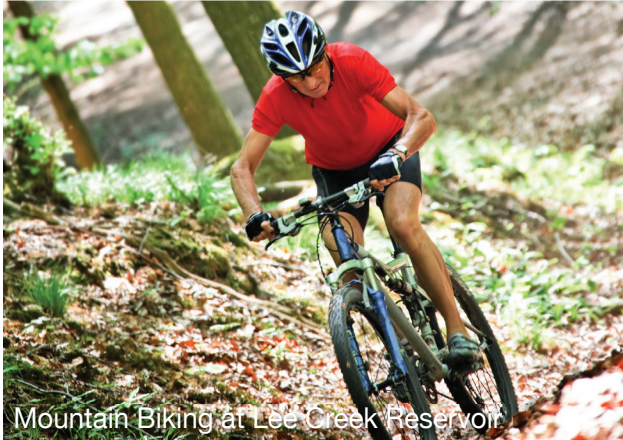
Mountain Biking at Lee Creek Reservoir

Explore the scenic beauty of Crawford County and the Ozark National Forest and discover your own adventure. Fish the Arkansas River, canoe the Mulberry, hike, bike, or take a boat ride at Lake Fort Smith State Park.