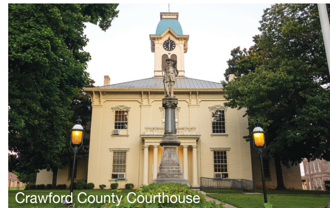
Crawford County Courthouse