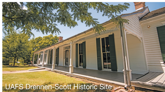
UAFS Drennen-Scott Historic Site