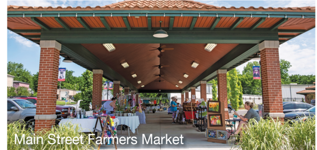
Main Street Farmers Market

The Main Street Farmers Market located in Freedom Park meets the community's need for healthy fresh food and provide a family friendly atmosphere with an inviting educational venue. Call 501-263-1611 for the seasonal schedule.