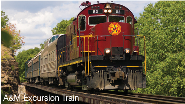
A&M Excursion Train

Scenic adventure awaits every visitor to the Gem of the Arkansas River Valley. Van Buren is the ultimate base camp for outdoor adventure offering comfortable and convenient lodging and great dining experiences for travelers at the end of an exciting day trip.