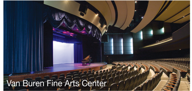
Van Buren Fine Arts Center

The Van Buren Fine Arts Center is a 1,500 seat concert hall that features state-of-the-art performing arts technology, and is uniquely designed to provide the best environment for all genres of music enjoyment. For more information, call 479-471-4017 or visit www.vbfac.org .