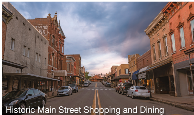
Historic Main Street Shopping and Dining

Our six-block Main Street is an award-winning National Historic District. Main Street is home to dozens of shops, restaurants and live music - appealing to all tastes.