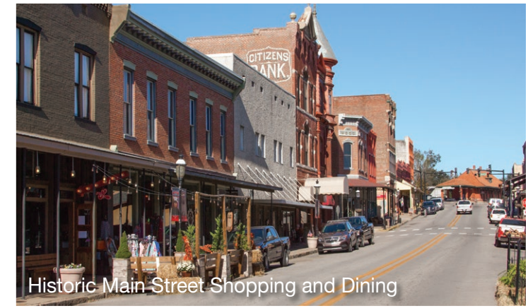
Historic Main-Street Shopping and Dining