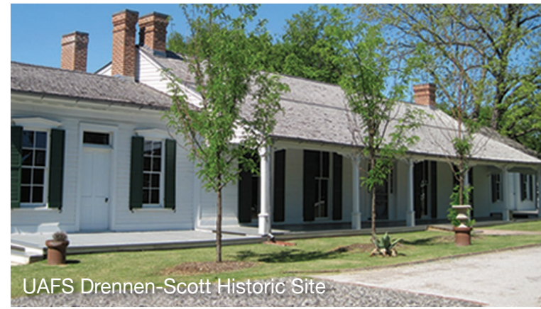
UAFS Drennen-Scott Historic Site