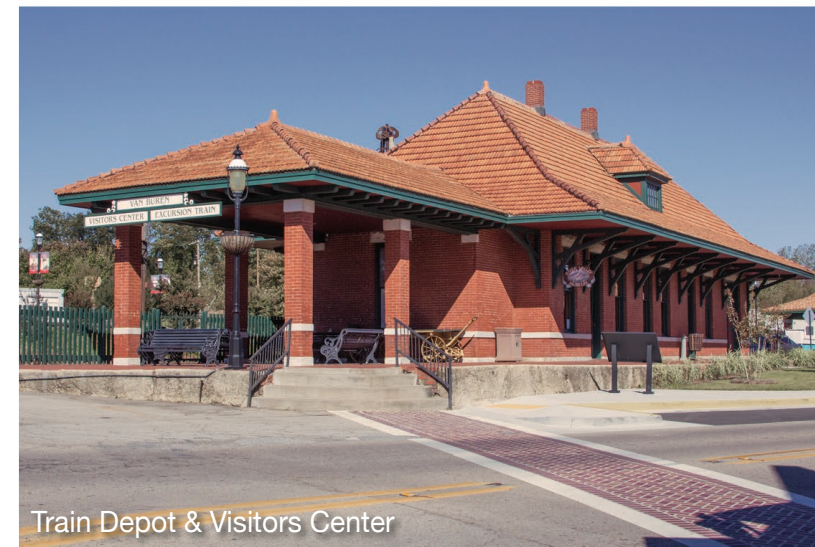
Train Depot & Visitors Center

Experience the Ozarks and enjoy the beauty of the Boston Mountains through the window of a vintage excursion train. Before boarding, don't forget to take a ride through the Main Street Historic District on the trolley to shop the unique specialty shops and antiques, enjoy live music and great food. The trolley runs Wednesday, Friday & Saturday, 9am to 3pm, April through December; Saturdays only January, February and March.