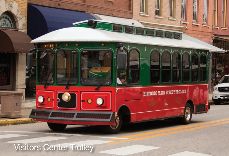
Visitors Center Trolley