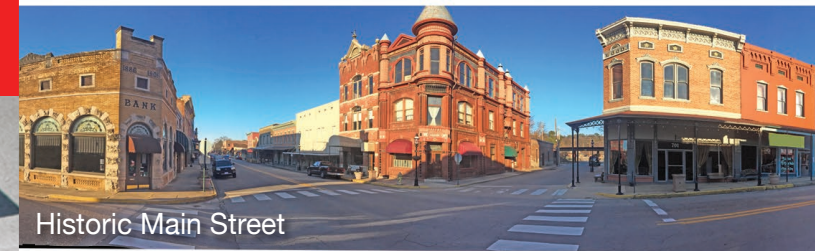
Historic Main Street

1-800-332-5889 www.vanburen.org www.facebook.com/VanBurenArkansas