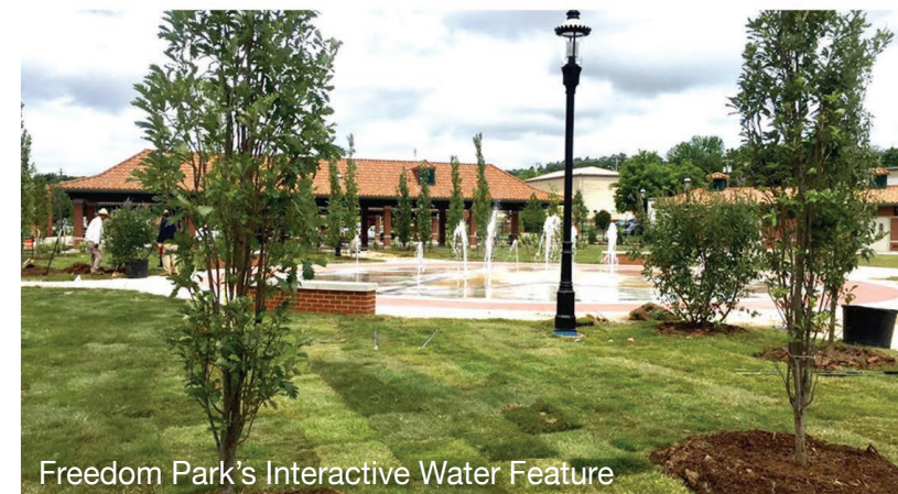
Freedom Park's Interactive Water Feature

Begin your adventure at Main Street's newest attraction, Freedom Park's Interactive Water Feature, located next to the Van Buren Visitors Center inside the train depot. Free Visitor's Guides and Restaurant Guides are available inside the Visitors Center for your convenience.