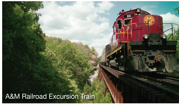
A&M Railroad Excursion Train